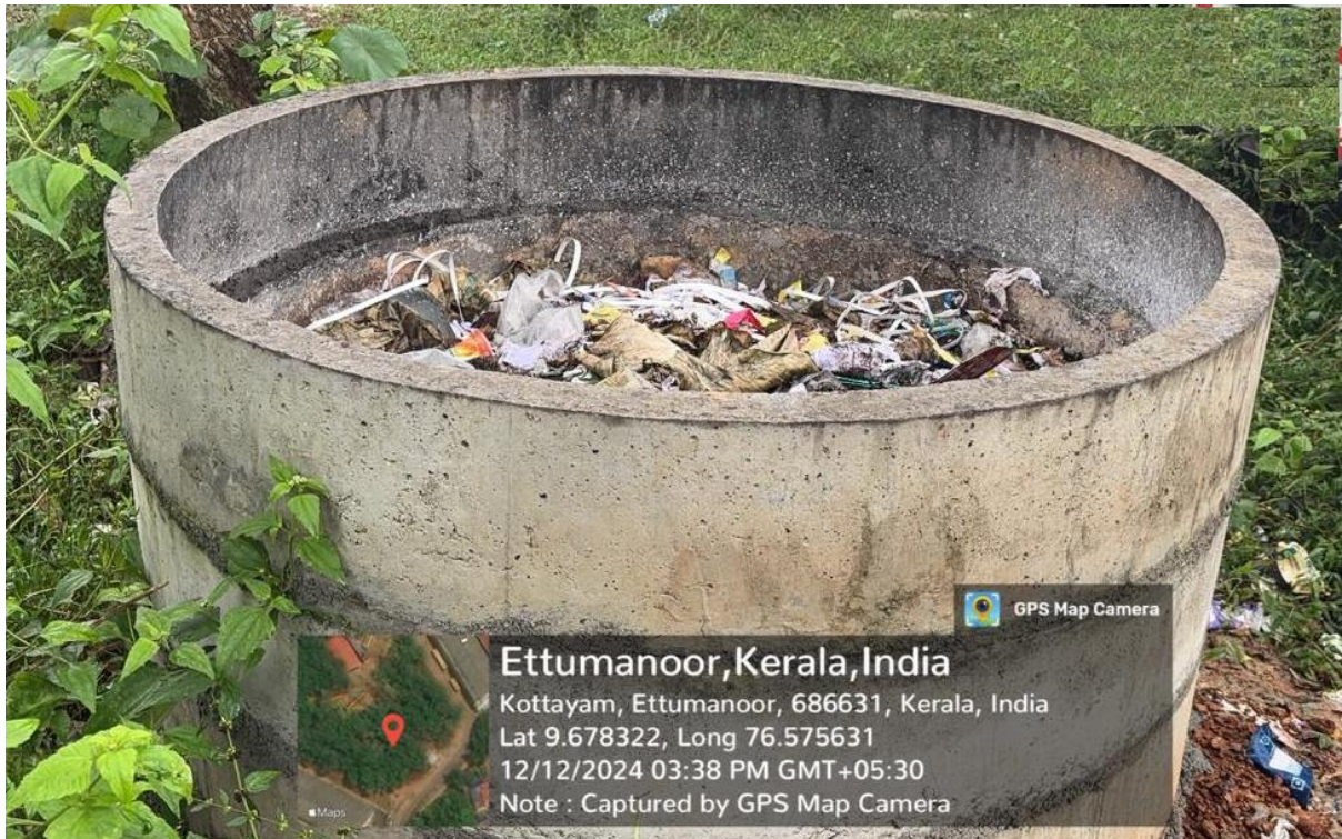
Fig. 2. Solid waste collected together for disposal