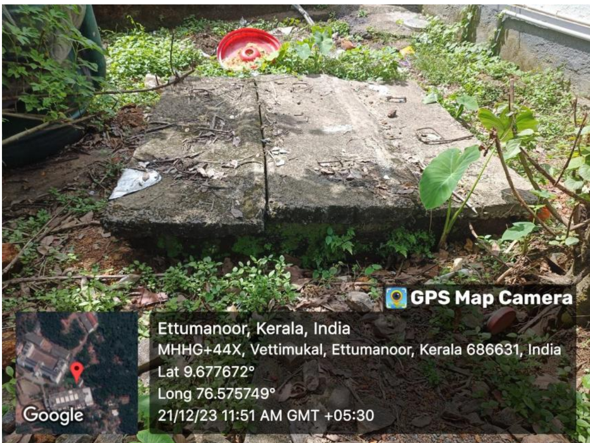
Fig. 3 Liquid waste management