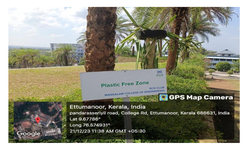
Fig. 6 Ban on Use of Plastics