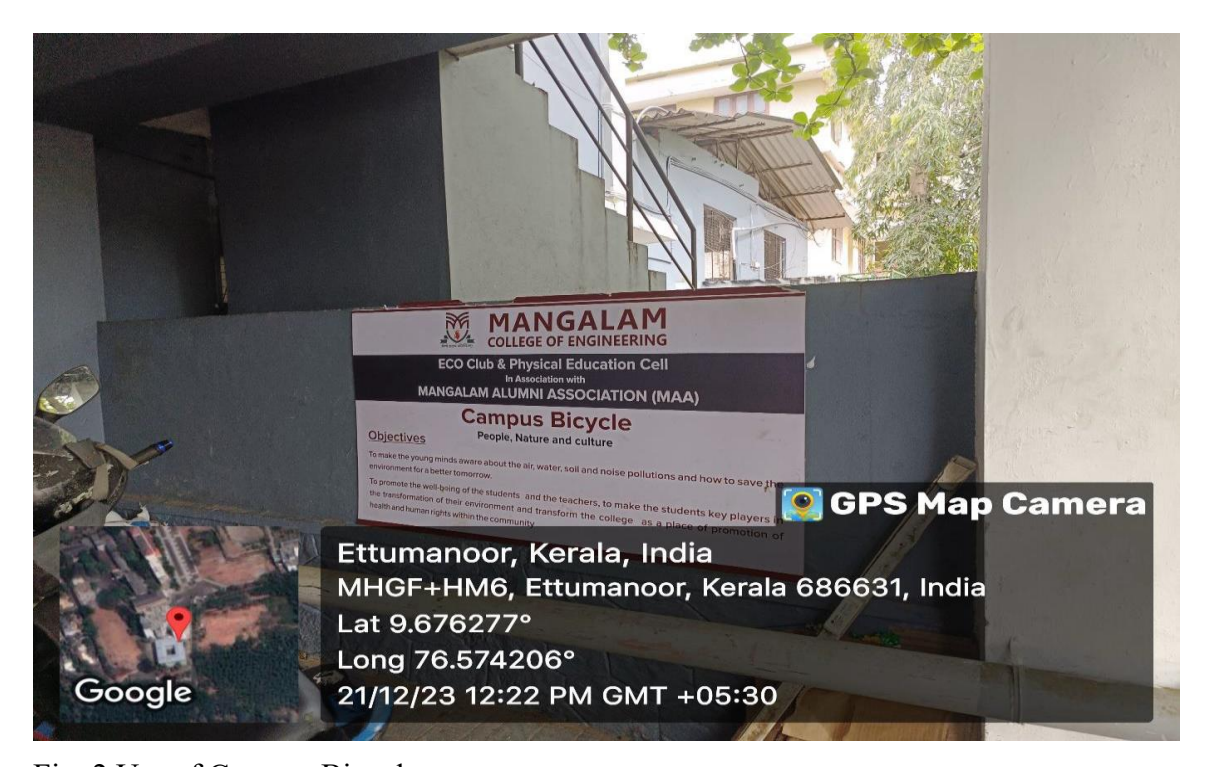
Fig. 2 Use of Campus Bicycles