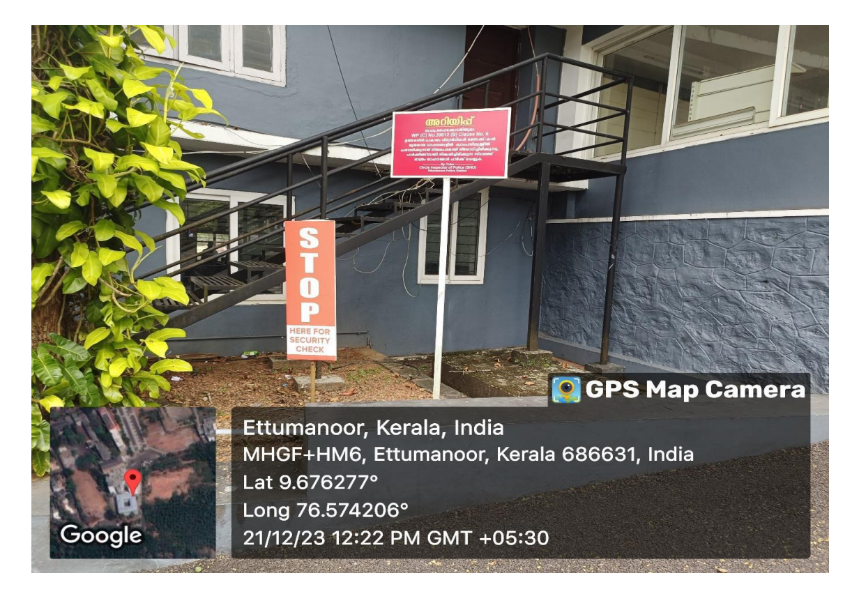
Fig. 1 Restricted Entry of Vehicles