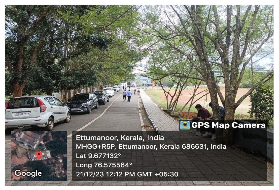
Fig. 4 Pathways