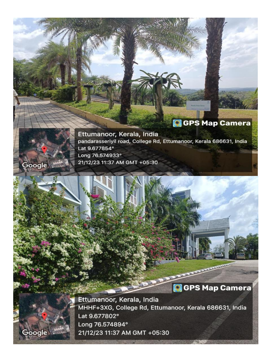
Fig. 5 Landscaping implemented throughout the campus